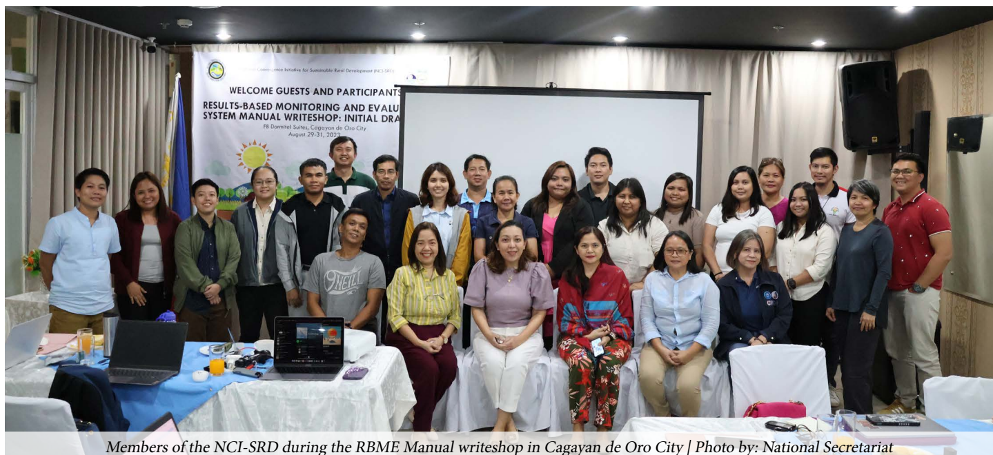
Members of the NCI-SRD during the RBME Manual writeshop in Cagayan de Oro City