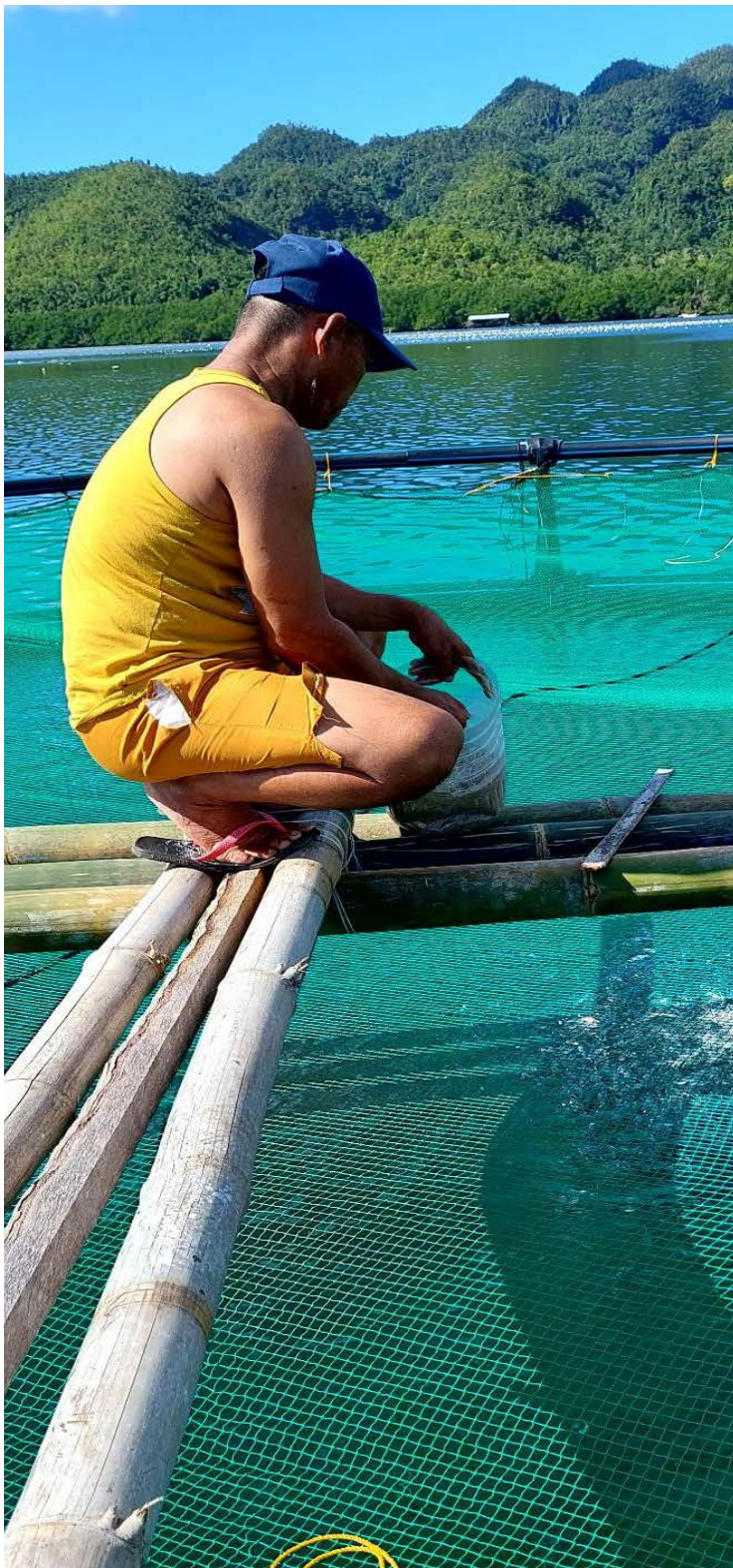
Fish Cage of PCPFA | Photo by: DA RCI TWG Central Visayas

By: Nicole Jimmy Ybañez, & Sherlane Baclay, DA RCI TWG Central Visayas