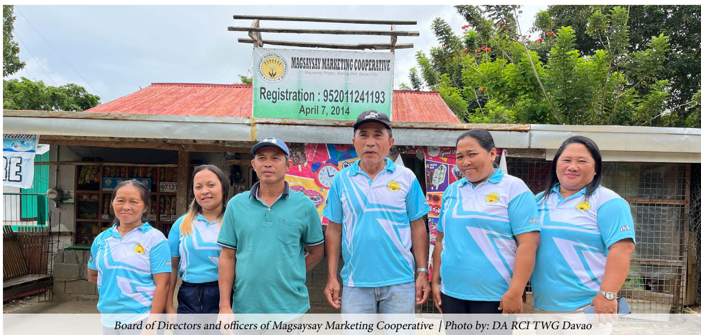
Board of Directors and officers of Magsaysay Marketing Cooperative