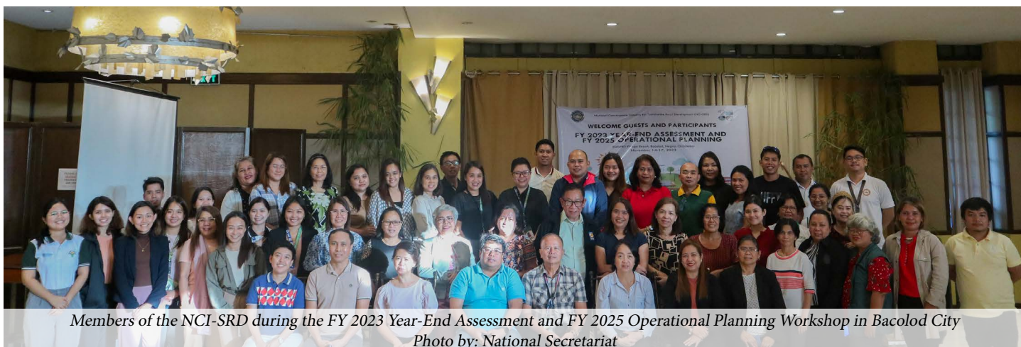
Members of the NCI-SRD during the FY 2023 Year-End Assessment and FY 2025 Operational Planning Workshop in Bacolod City