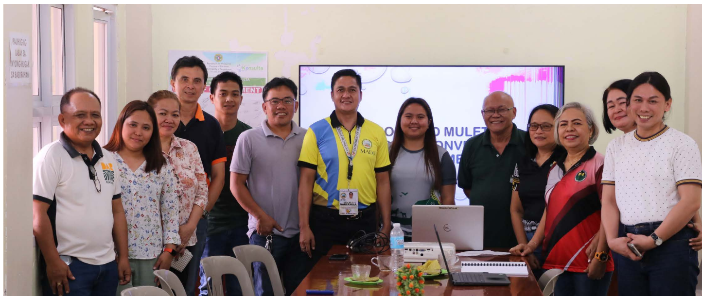
The RCI-TWG conducted a final review and critiquing of the Muleta Watershed CADP to jointly help in achieving clean and sustainable water resource for agriculture, industry, and economy.

Comments and suggestions from members of the RCI-TWG will be incorporated into the final document before the final presentation to the National Steering Committee for review and approval in October this year. ###