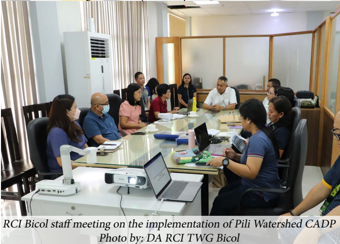
RCI Bicol staff meeting on the implementation of Pili Watershed CADP

Good news to the residents of barangays Poblacion, Maypangi, La Union, Milagrosa, Libtong, Bagalayag, San Isidro, Monte Carmelo, Canjela, Maracabac, Oras and Dancalan in Castilla, Sorsogon!