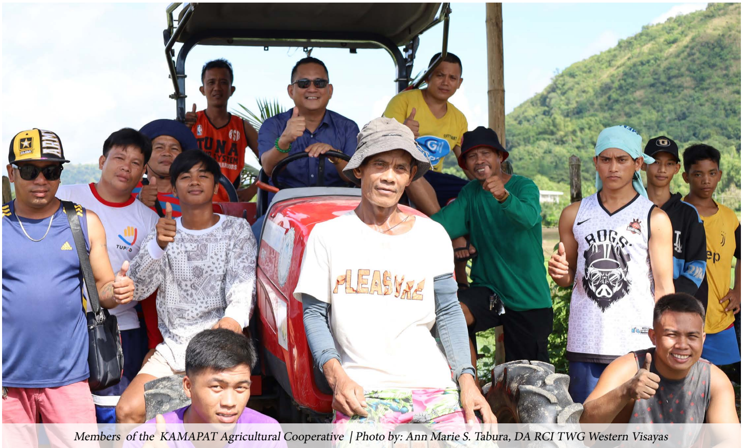
Members of the KAMAPAT Agricultural Cooperative